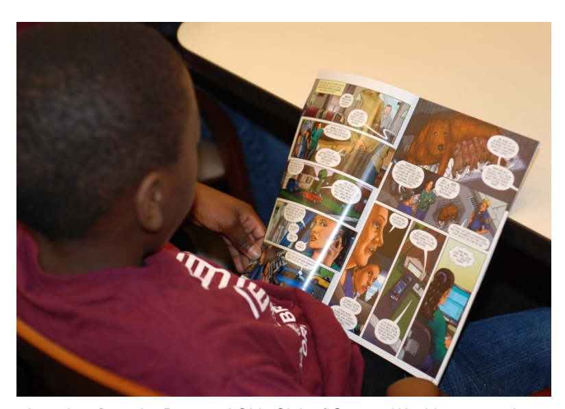
A student from the Boys and Girls Club of Greater Washington reads a Justice Case File.